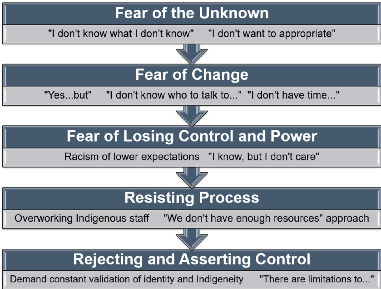
Fig 4.2: Levels of Indigenization. [Long Description]

If you are at a point of Indigenizing your practice, you may still have to face fears and concerns. When developing the framework for the Indigenization project, the project steering committee considered the statements and instances where systemic change is not supported. The committee members then situated them in “levels of Indigenization.” These levels progress from fears to control and then rejection of Indigenization processes. They are not progressive levels, but they show that there are various levels of resistance and barriers to Indigenizing practice, field of study, and institutions.