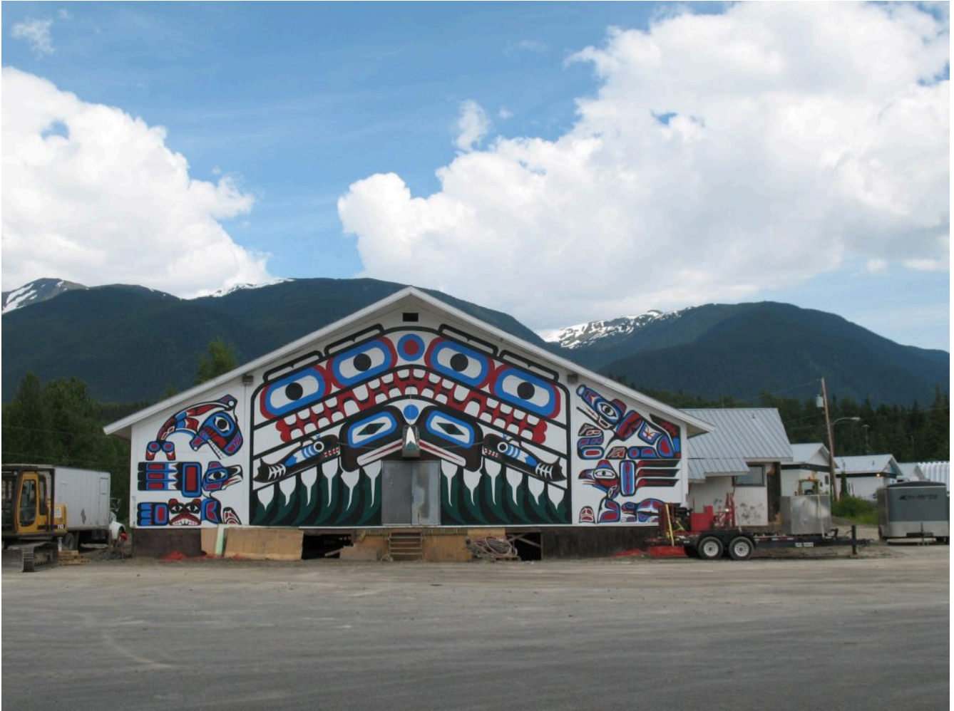
Fig 4.1: Traditional Nisga'a house in New Ayanish.