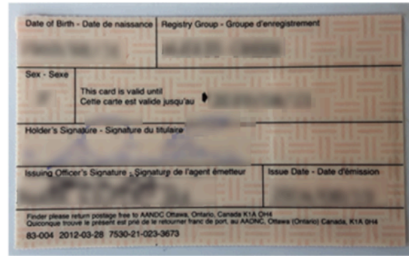
Fig 1.2: Status identity card.