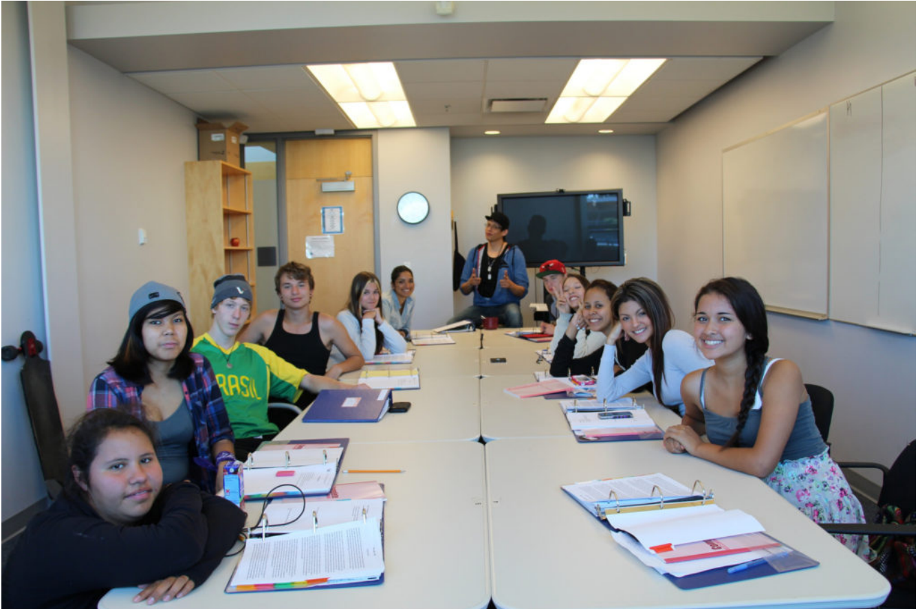
Fig 1.1: Aboriginal math/English camp.