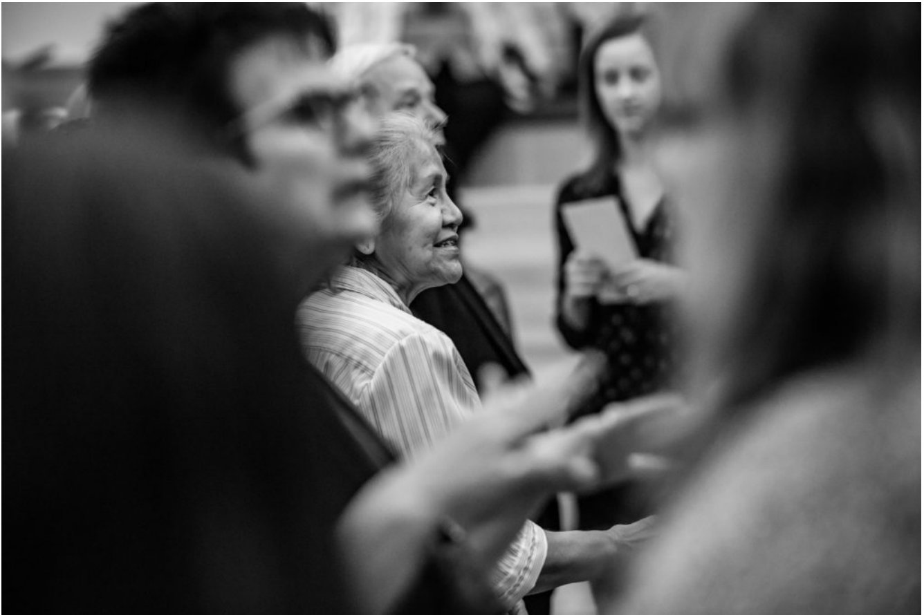
Fig 2.1: Indigenous graduate reception.